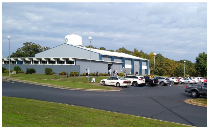
Municipal elections will be held at the William B. Shuford Recreation Center on Pinewood Road in Granite Falls

The Caldwell County Board of Elections is located at 120 Hospital Avenue in Lenoir. The office is open on weekdays from 8 a.m. until 5 p.m. The phone numbers are 828-757-1326 and 828-757-1342. The mailing address is P O Box 564, Lenoir, N. C. 28645.